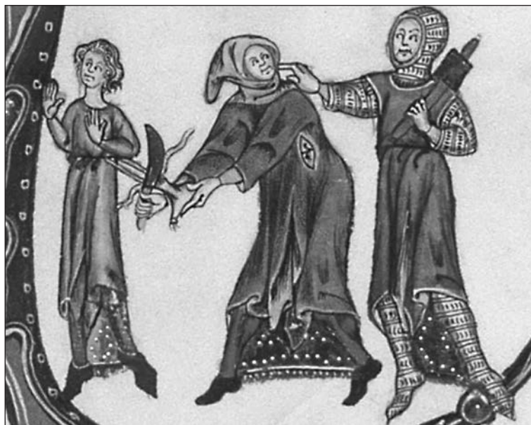
[Combating crime in the medieval era]